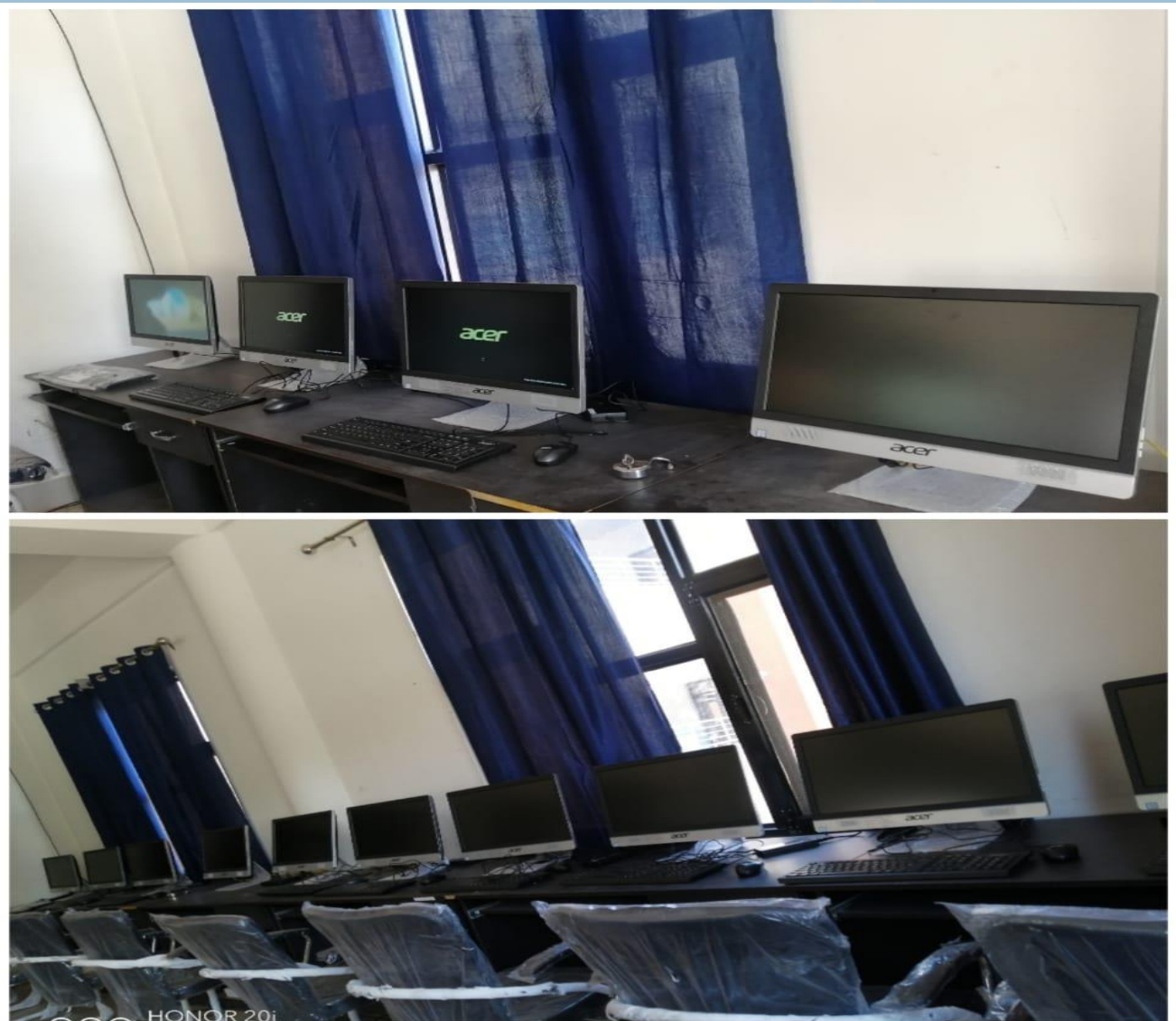
BROWSING CENTRE GOVT. DEGRE COLLEGE SURANKOTE

Government Degree College as recently established Browsing Centre fully ICT enabled for the students with more than 100 mbps internet speed. Students can avail this facility as per the instructions designed by the Coordinator of the Centre free of cost.